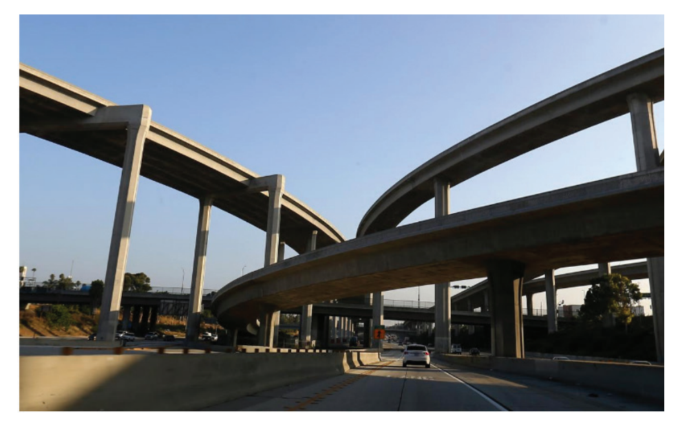
An automobile travels in a carpool lane along the highway system into Los Angeles, California, U.S. August 10, 2017.